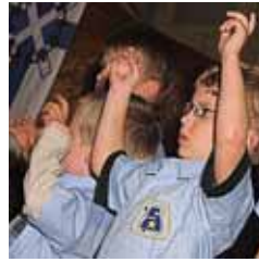
Fresh expressions p5