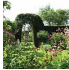
What's On p7