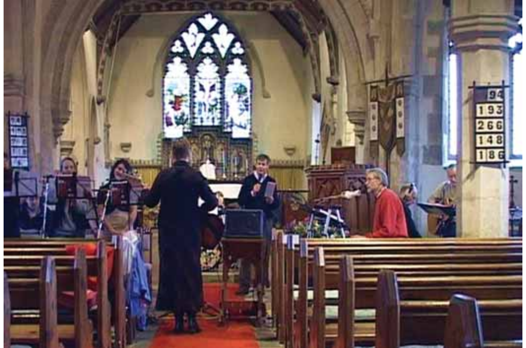
Photo: Practising for Electric Church at St James, Syresham. See page 3.