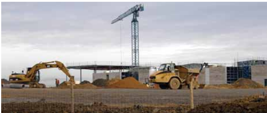
Photo: The new Academy school, due to open in September, takes shape at Priors Hall, north east of Corby. It is part of a 5000 home development.