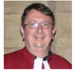
A year as Dean p8