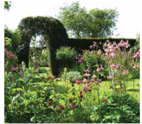
Woodend open gardens, 8th June

Sat 17, Abington Choir Concert, 7pm at St Peter and St Paul, Abington (The Church in the Park). Music through the centuries and A Mass for Peace by Karl Jenkins. Tickets £5 on door.