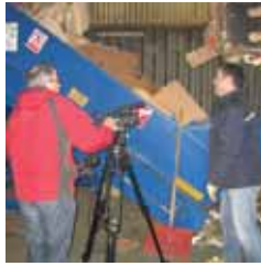
Working lives p3