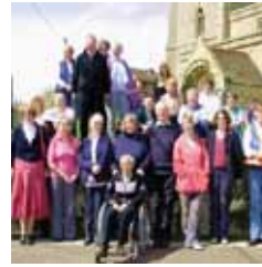
A heart for children p5