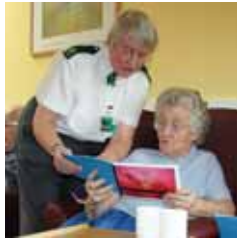
God is not ageist p3