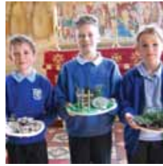
Abundant gardens p5