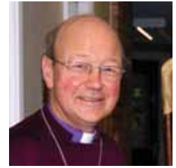
Bishop in action p8