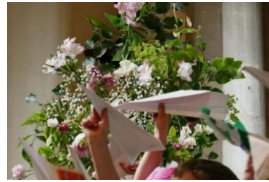
Christingles are popular...