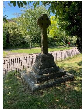
The village war memorial

The church enjoys 4 bells which are rung on occasion (and we have new village bellringers in training to enable this to become more frequent), stained glass, very old pews and a fine brand new 3-console organ which is a real delight in support of our prayer and worship. We have a resident organist, who also plays for the benefice services and where possible has supported other parishes' special services.