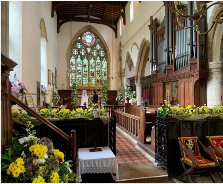
Wedding in the beautiful setting of St Peter's Church, Raunds