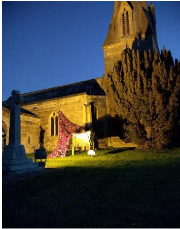
Church of The Nativity of the Blessed Virgin Mary, Ringstead