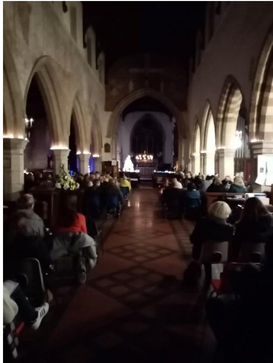
The busy carol service at St Peter's