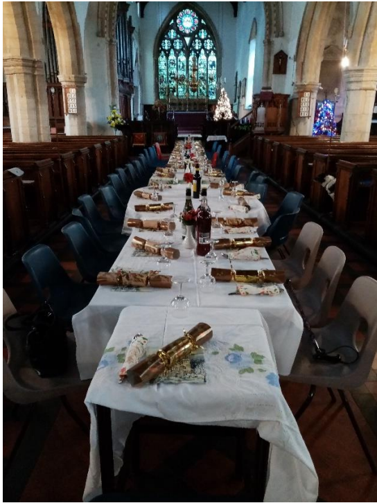
The Christmas party preparations