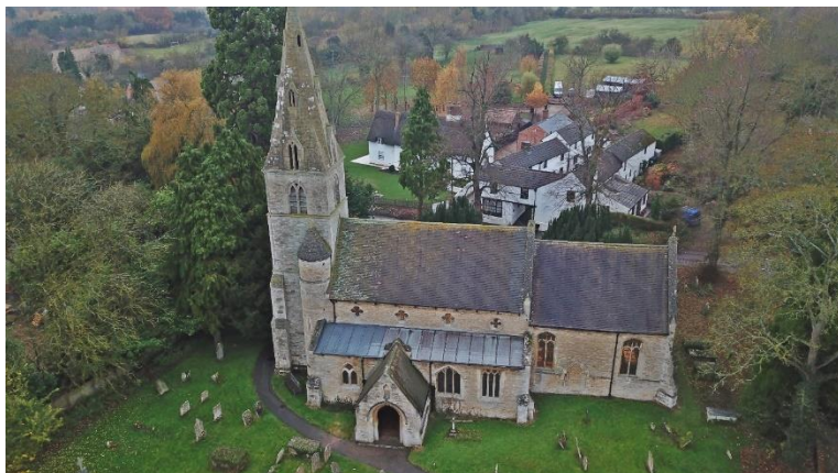
Aerial View - All Hallows' Church, Hargrave