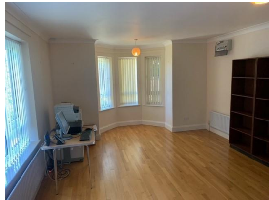
Study and meeting room