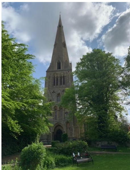
West End, St Peter's church,