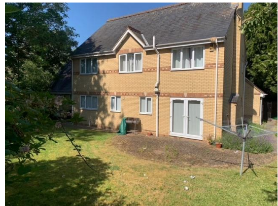
Back garden and patio