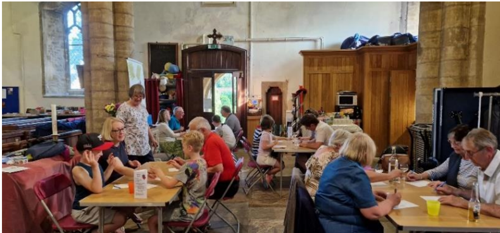
St. Laurence's family beetle drive in full swing .....