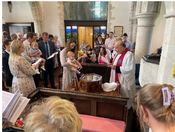
A joyful baptism – All Hallows’ 2023