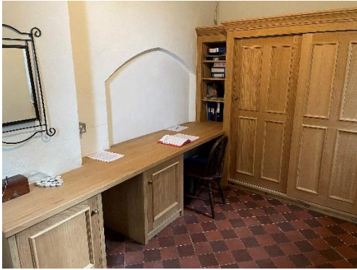
The newly refurbished vestry

The 12 th century All Hallows' church at the heart of Hargrave village recently undertook repairs to the floor and roof, and completely refurbished the vestry. More external works (for which it has a combination of funding and self-help) together with some internal flooring repairs are identified in the latest quinquennial report: these are in hand and the remainder planned for execution in the coming 24 months.