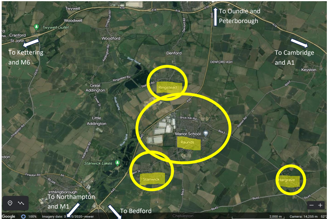
Map showing the relative geography of the Benefice parishes