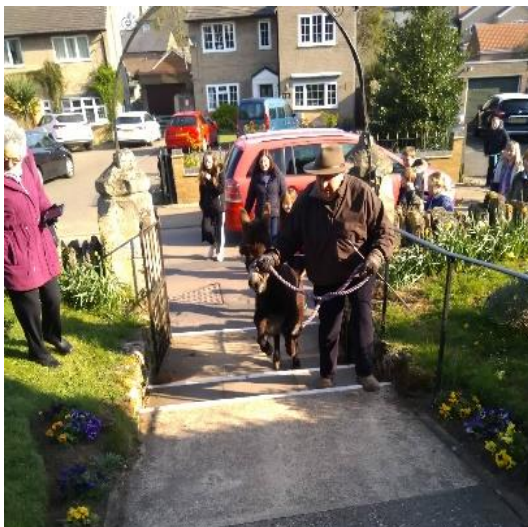
“Make Way, Make Way....”

They would also need to be willing to engage with the leaders of the ‘Shared Church’ and continue