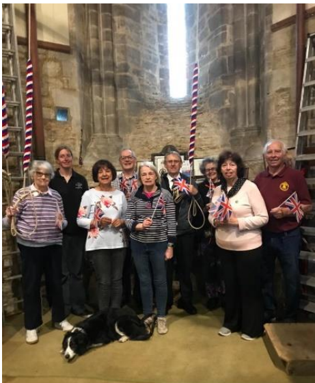
Bellringers' practice – Tuesday afternoons

Finances are kept in good order by a parish treasurer.