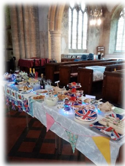
Jubilee preparations in the church