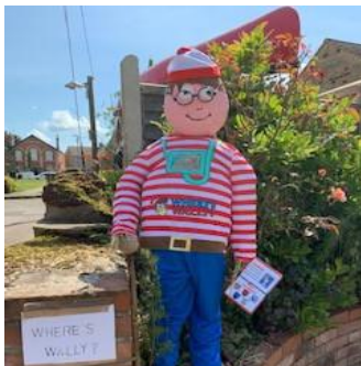
"Where's Wally?" Competition

"Tea with Friends" meets monthly and provides a social occasion for the older members of the village to come together to enjoy companionship, and afternoon tea. This is especially valued by those who now struggle to have time away from home or to leave the village because of transport issues. It presents a wonderful pastoral opportunity.