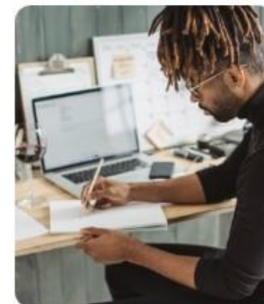
A graphic designer working from home.

Were you aware there are so many different types of flexible working? Do you think you would choose to work flexibly? Why?