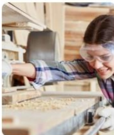
A joiner working flexitime.

I have a job share. We work really well together and because we have different strengths and skills, we both bring a great deal to our role. It also means I can spend time with my young children on the days I am not working.