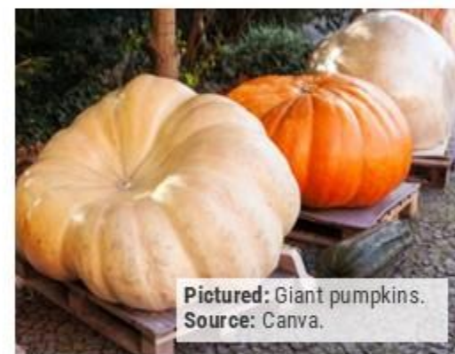
Pictured: Giant pumpkins.

Have you spotted any pumpkins? Were they giant?