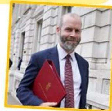
Pictured: Jonathan Reynolds.

UK Business Secretary, Jonathan Reynolds.