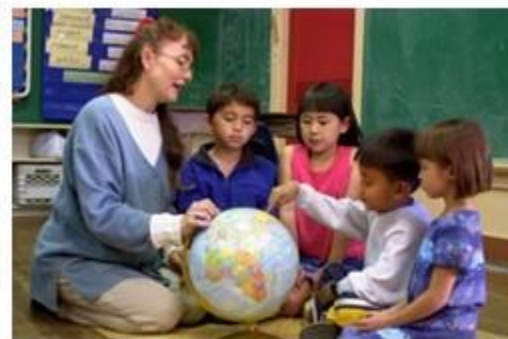
Pictured: Teacher and students with a globe.