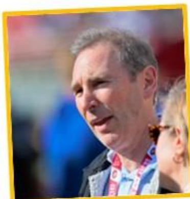
Pictured: Andy Jassy.

The advantages of being together in the office are significant... in summary, we've observed that it's easier for our teammates to learn, model, practice, and strengthen our culture... teaching and learning from one another are more seamless; and, teams tend to be better connected to one another.