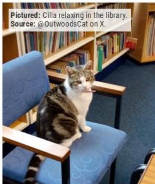
Pictured: Cilla relaxing in the library.