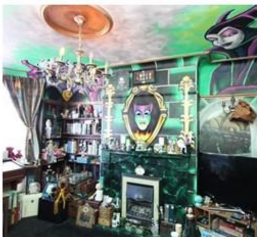
Pictured: The interior of the Disney themed house.

A uniquely decorated home has gone viral after it was put up for sale by its Disney superfan owner! The estate agents in charge of selling the home posted that their advertisement had gone global: 'Our property listing has captured the world's attention, and we couldn't be more thrilled! 🇬🇧' The Disney-themed home features huge murals of famous characters, such as Aladdin, Mary Poppins and Peter Pan. The property is in the Welsh seaside