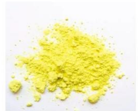
Pictured: Magical carbon catcher, COF-999.

change. It's like giving the planet a big helping hand!' The new material could play an important role in protecting the Earth and all the creatures that live on it. What a clever way to make the world a healthier place!