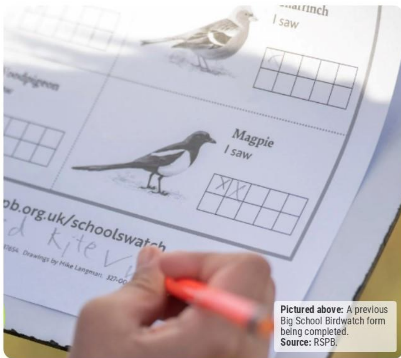
Pictured above: A previous Big School Birdwatch form being completed.

In 2023, the top five birds spotted in the Big Schools' Birdwatch were blackbird, woodpigeon, house sparrow, starling and magpie.