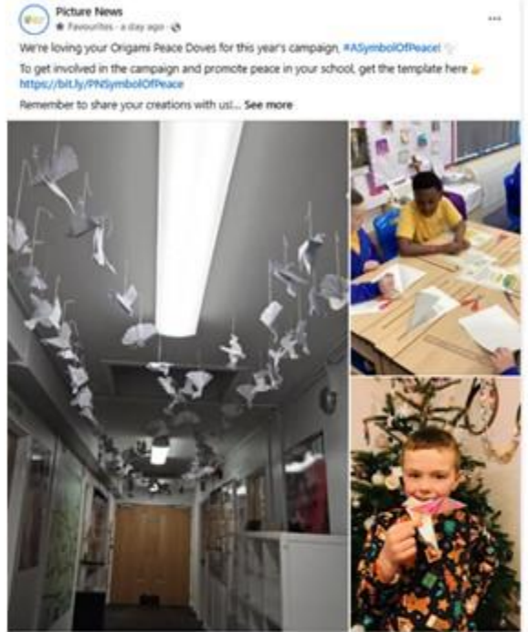
Pictured: Origami Peace Doves.

Should everyone have the opportunity to be a star?