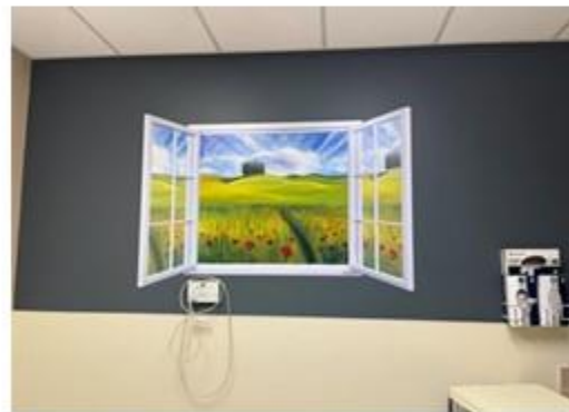
Pictured: LandEscape window murals painted in Roswell Park Comprehensive Cancer Center.