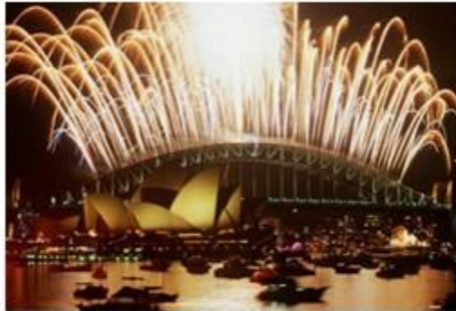
Pictured: Fireworks at Sydney Harbour Bridge, Australia.