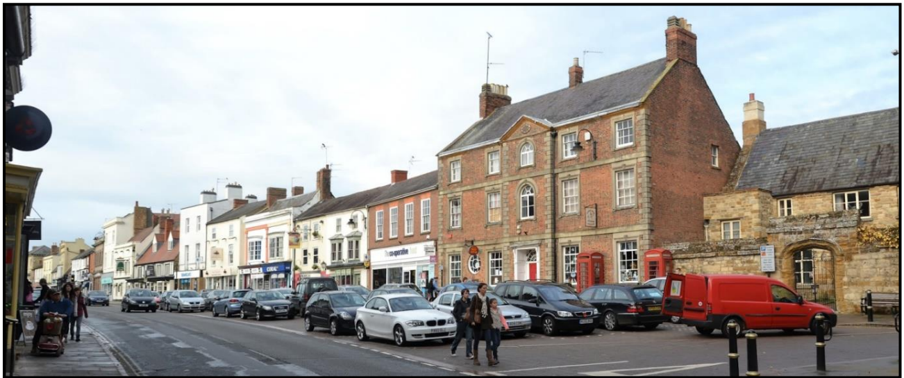
Watling Street, Towcester

Watling Street is now more commonly known as the A5 and Towcester is sited at its intersection with the A43. This makes the area an ideal place to settle with easy access to London, Birmingham, Oxford, Milton Keynes and the North. Both the M1 and M40 are within easy reach, as are main line rail services, which can be accessed from Northampton, Milton Keynes and Banbury. Although public transport to the villages is limited, many local inhabitants commute to London, Birmingham and Milton Keynes, whilst others work in a variety of small local industries and in farming. It is also ideally located for longer journeys with easy access to Luton, London Heathrow and Birmingham Airports.