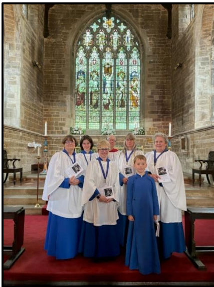
St Lawrence Choir

The congregation at St Lawrence has diminished following the pandemic and is slowly rebuilding. The work of the Children and Families Mission Enabler and the work done in the wider community during the pandemic and the Ukraine crisis have resulted in strong feelings of goodwill in the community towards the Church. This has not yet however translated into increased church attendance.