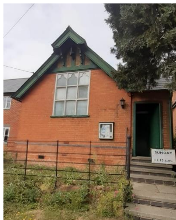
St Augustine's Church Caldecote