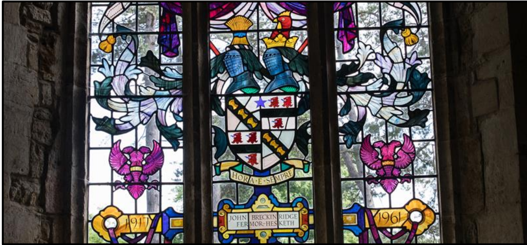
John Breckinbridge Fermor-Hekseth Window