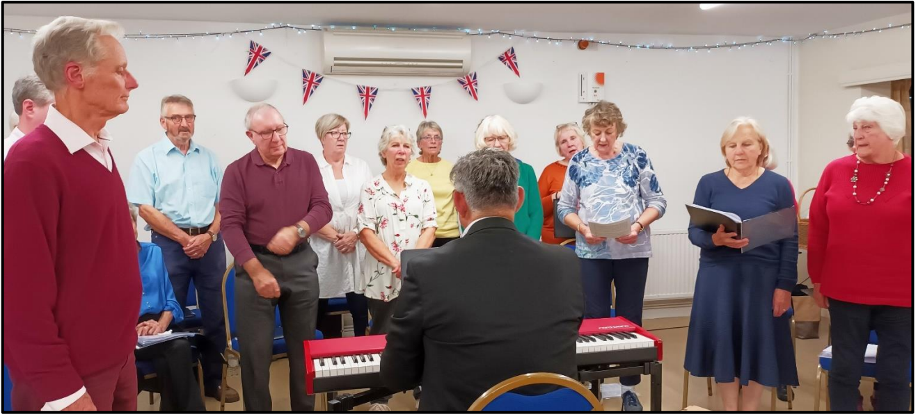
Community Choir at our Harvest Meal