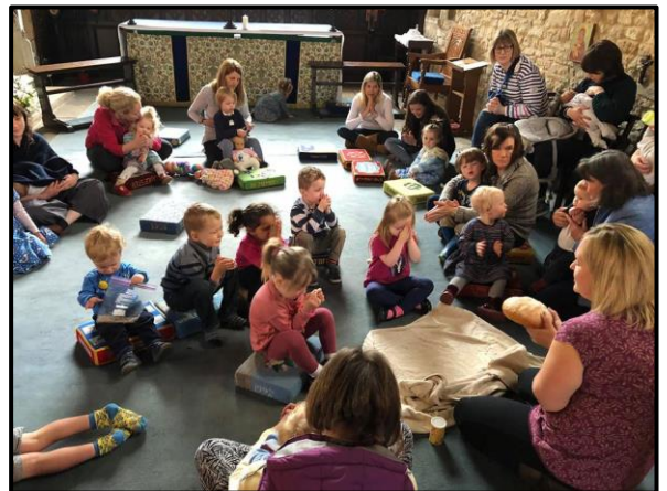
Little Sprouts Praying

Little Sprouts – this is the St. Lawrence Pre-School Group that meets every Thursday morning in term-time, run by the Children and Families Mission Enabler and volunteers. Many of the Little Sprouts families also attend Church on the first Sunday of each month.