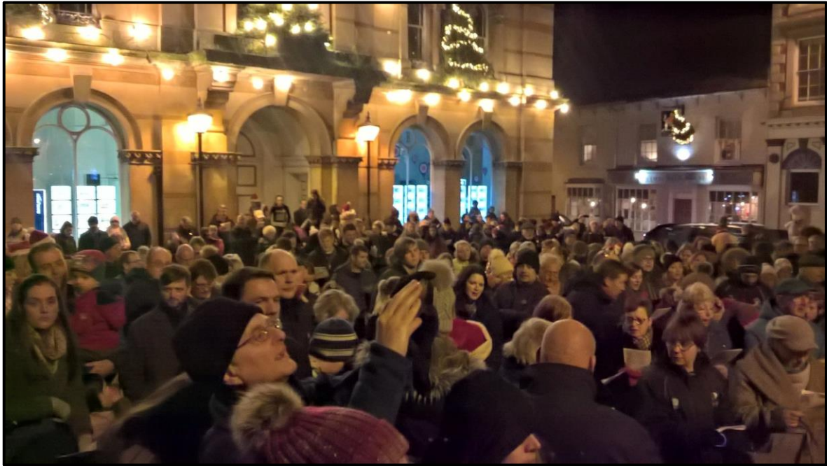
Churches Together Carols in the Square

Members of the Ministry Team regularly visit our local nursing and residential homes. We lead monthly services in four establishments as well as making prayer visits to some residents' rooms (accompanied by a member of the home's staff). These are a mixture of Communion and Informal Worship services. We are sometimes supported by a keyboard, but often use CDs.