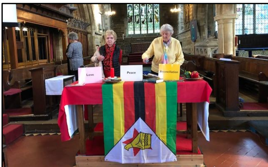
Churches Together World Day of Prayer

As part of Churches Together in Towcester, church members are actively engaged in both Towcester Foodbank (which is part of Trussell Trust) and Renew 169 Wellbeing Café. During the year, the CFME and the Youth Minister for the Baptist church lead 'It's your move' transition work with year 6 pupils. We run joint Lent courses, Carols in the Square, World Day of Prayer and Prayers for Christian Unity. We have very good working relationships with the ministers of Churches Together, the Anglican church, Methodists, Catholics and Baptists.