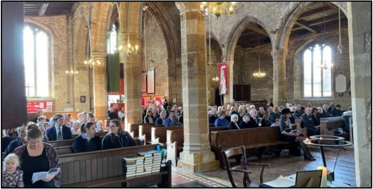
Commemoration and Thanksgiving Service for Queen Elizabeth II