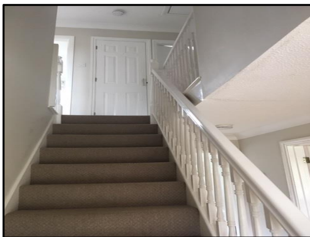
Stairs to Landing