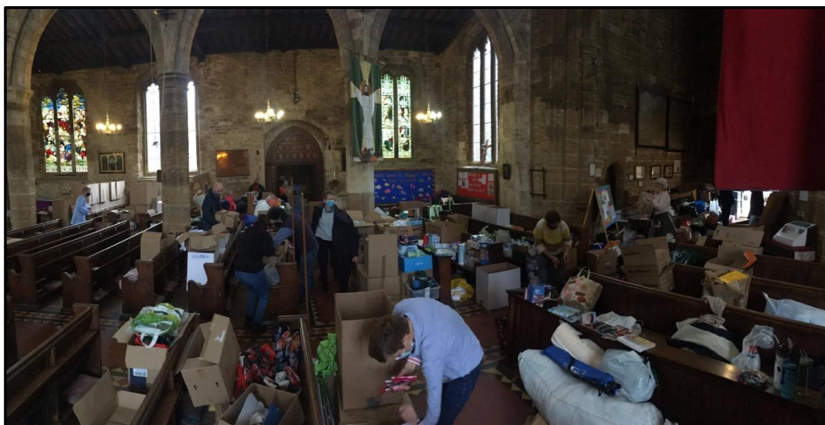
Ukrainian Aid Collection

We are an outward looking Benefice, increasingly looking to raise our profile. We are also becoming known for the wider support that we provide. In 2021 we hosted pilgrims from the Camino to COP which in turn instigated a small group from across the Benefice to explore renewable and sustainable energy provision. Thanks to a feasibility study grant we were able to enlist the help of consultants, who produced a Benefice-wide recommendation report. This report is in the process of being reviewed and next stages set out.