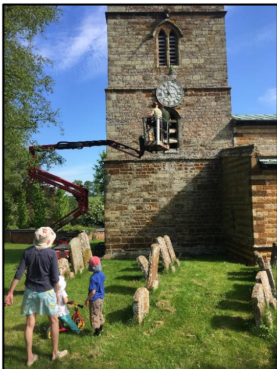
Removal of the clock face for repair

At Christmas, the Church organises carol singing in the village with a local brass band, as well as a crib and carol service, which was attended in 2021 by more than 50 people. Messy Church at Christmas is a ministry to children and families, which was started in Bradden and has now been taken up by the other parishes in the benefice.