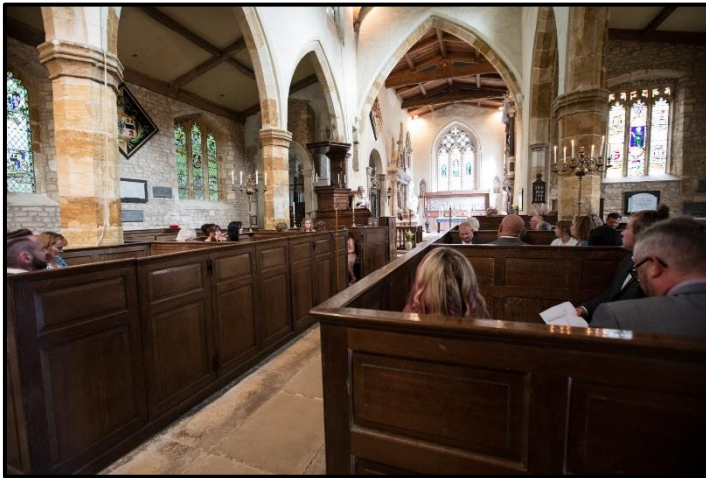
Wedding at St Mary's

The Parochial Church Council consists of two Churchwardens, Secretary, Treasurer, Lay Reader and three others. The upkeep of the grounds is covered by two members of the congregation.