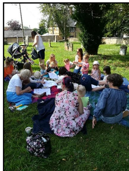
Tots Own Picnic

We have several special services in the year including Mothers' Day, Harvest Festival, a Memorial Service for the Bereaved, Christingle, Carols by Candlelight and a Christmas Crib service. We support the Benefice Children and Families Mission Enabler who runs special events at the church at Easter and Christmas.