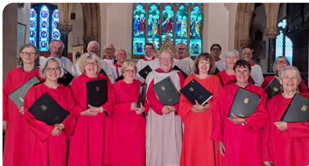
Uppingham Parish Choir