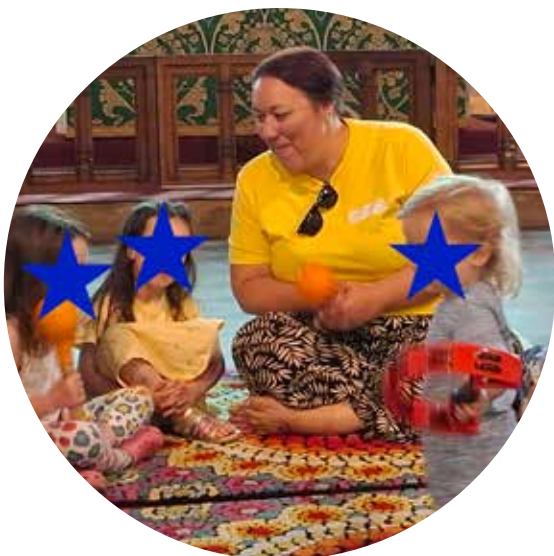
Little Fishes Toddler Group