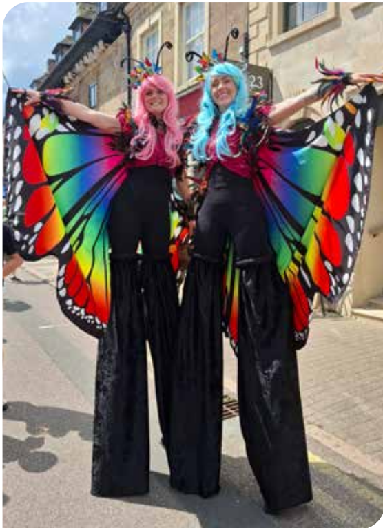
Uppingham's Summer Feast Day

All of this while retaining a 'village feel'.