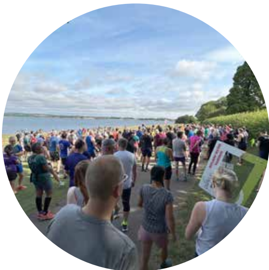
Below: Nearby Rutland Water and its weekly Park Run