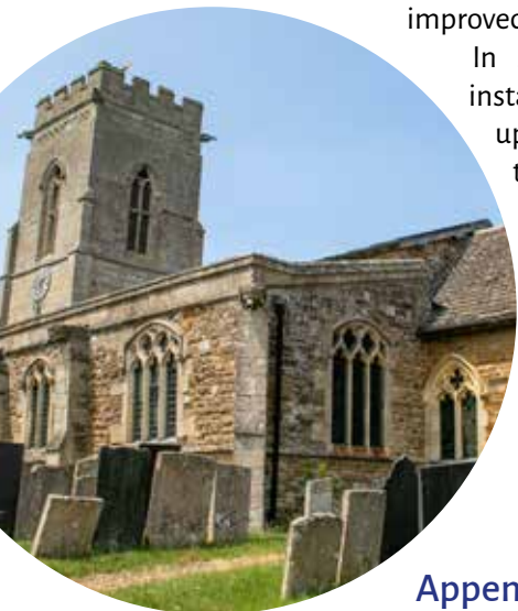
Above; SS Peter & Paul, Uppingham. Below; St Peter's, Belton

The last major changes were made around 1897-1898. The Chancel was remodelled and has an ornate altar and organ case in the style of Bodley, all of which have been cleaned and restored within the last 25 years. There is a Nicholson organ which is regularly maintained. The tower has a set of six bells.