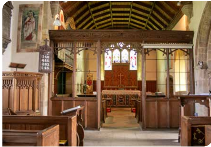
(Left) Chancel of St Peter's, Belton (Right) South Aisle

The parish of Belton with Wardley was formed in 2010, by the merger of the former parish of St Botolph, Wardley, with the parish of St Peter, Belton. The enlarged parish has a population of about 360, of which about 20% are aged under 16 years. Together we make up half of the Uppingham Benefice.