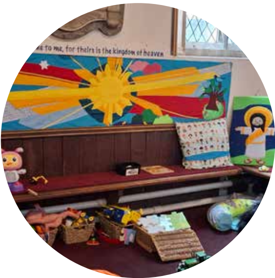
Children's area in SS Peter & Paul's