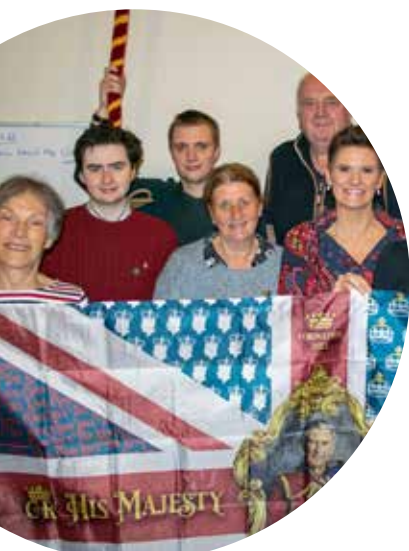
Bell Ringers celebrate King Charles' Coronation