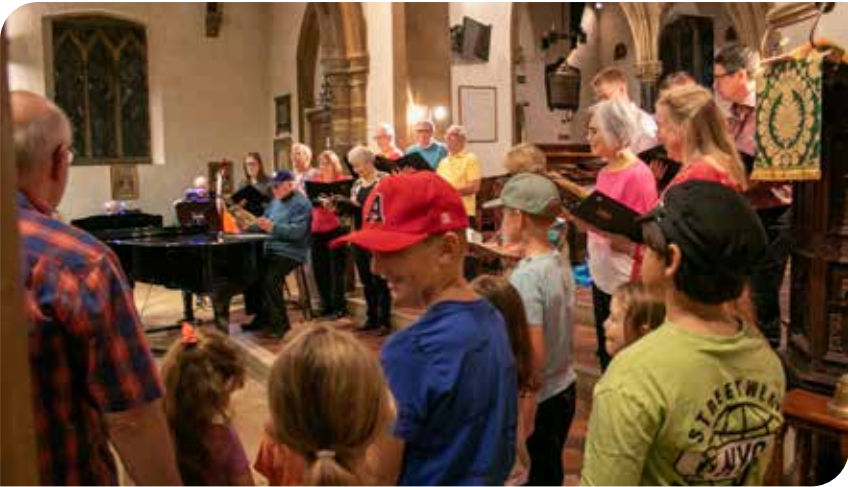
A performance of Captain Noah & His Floating Zoo in church

What work is outstanding? Given the historic nature of the buildings, there is always more both parishes could do. All Priority A issues are addressed. Both buildings are sound, weather proof and have heating systems.