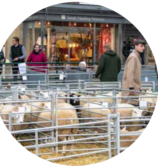
Annual Fat Stock Show in Uppingham Market Place.