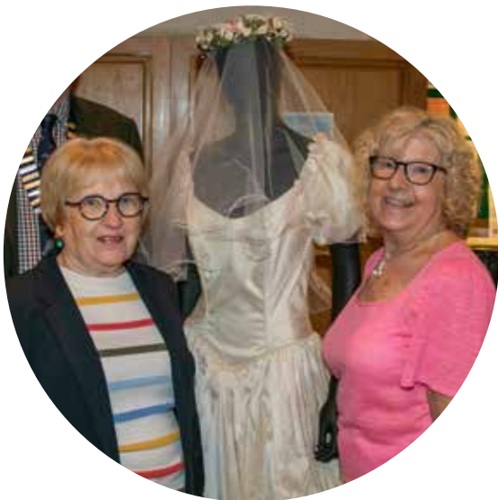
Wedding Dress Festival