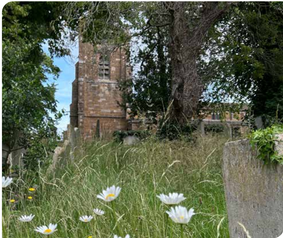
St Peter & St Paul's Uppingham and our Silver Eco Award winning churchyard