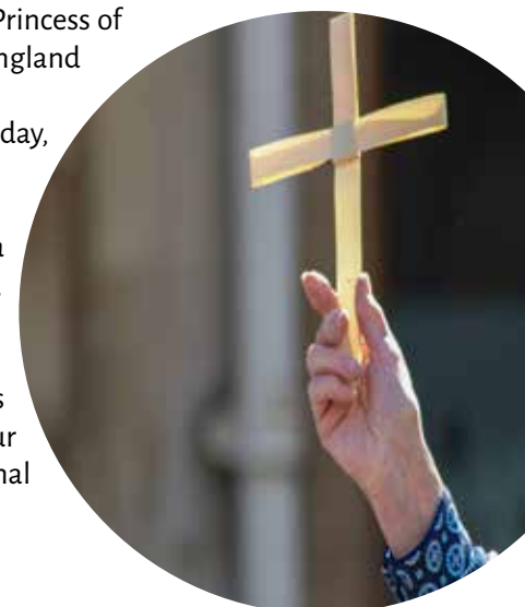
Palm Sunday in Uppingham Market Place