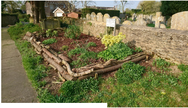
Spring on the

Our 'garden for nature' is a small area just outside the churchyard wall where wildflowers now thrive and other nectar rich plants grow. Work started in 2014 when the top 50mm of soil was removed. Weeds that grew during the summer were dug out during the autumn and wild plant seeds sown. The top soil was piled at the back of the site and nectar rich plants planted there to provide food for insects. There is a log pile and an area set aside for visiting hedgehogs