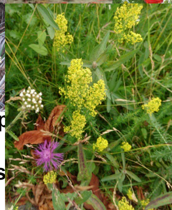
Summer flowers; corn cockle, poppy, oxeye daisy, common knapweed and lady's bedstraw