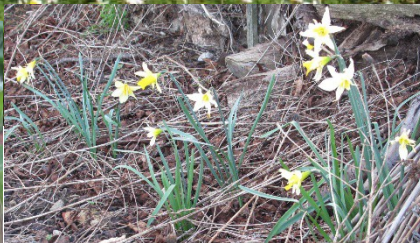
March 2020 Cowslip Grown from seed and native daffodils